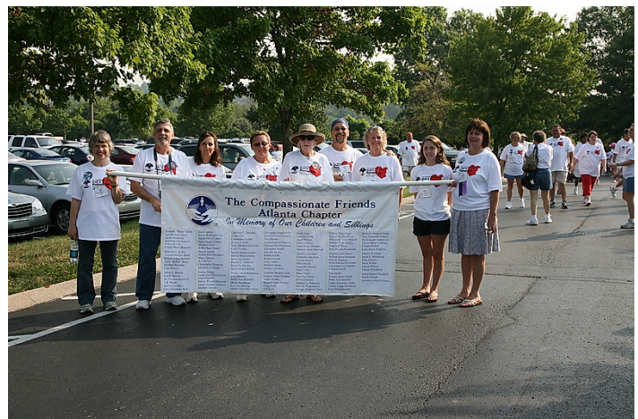
Sample Banner from 2008 Walk at the Nashville Conference "Atlanta Walks... In Memory of Our Children and Siblings"

Thank you for your support. (Deadline June 15)